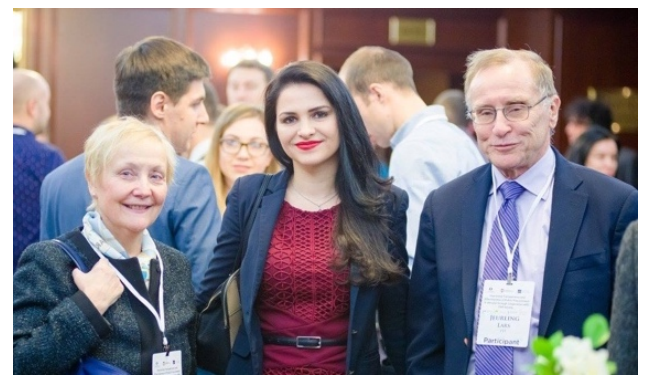
PICTURED: Participants of the Improving Transparency and Effectiveness of Public Procurement in Ukraine through Cooperation with Civil Society program launch in January 2017.