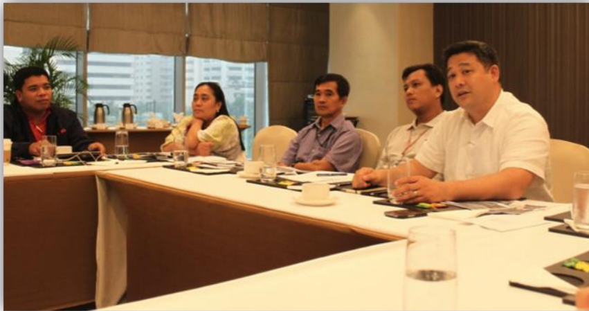
DepEd Asec. Rey Laguda as he gives his inputs on the recommendations on how to sustain monitoring of education service deliveries after the presentation done by the G-Watch team.

To facilitate better appreciation on the major recommendations, they were operationalized and broken down into specifics. In the end, the formula of local hubs is recommended in order to enable an effective and efficient school-based monitoring.