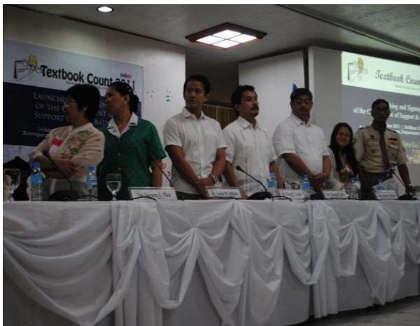
Representatives coming from different partner organizations stand for the official re-launching of Textbook Count

On September 5, 2011, organizations which have been part of the Consortium of CSOs for Textbook Count were once again convened by the Ateneo School of Government. This coming off together of the CSOs for Textbook Count was done to provide support in sustaining and coordinating implementation of the Textbook Count and Textbook Walk. The next steps were also discussed and area assignments were agreed upon by the participating organizations.