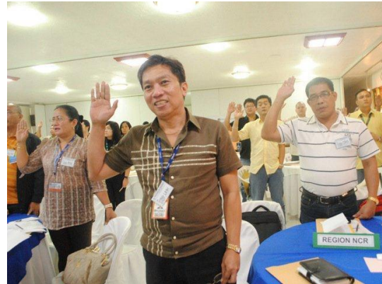
Different DepEd and CSO representatives pledge their commitment to the Bayanihang Eskwela Initiative during its nationwide roll-out launch.

These included Boy Scouts of the Philippines, Civil Society Network for Education Reforms (E-Net), Consortium of Bangsamoro Civil Society, DepEd, DPWH, Girl Scouts of the Philippines, National PTA Confederation, Northern Luzon Consortium for Good Governance, Procurement Watch, Inc., Public Services Labor Independent Confederation, Young Moro Network for Social Accountability, Western Visayas Network of Development NGOs and. These organizations were asked to invite their local counterparts who can serve as local coordinators for the nationwide implementation of Bayanihang Eskwela.