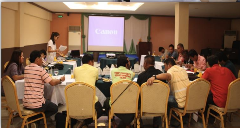
Members of the Local Hubs in ARMM during the mapping workshop of the monitoring activities usually conducted for SBPs, textbooks and school furniture.