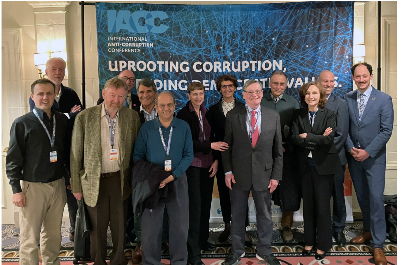
PTF representatives at the International Anti-Corruption Conference in December 2022.