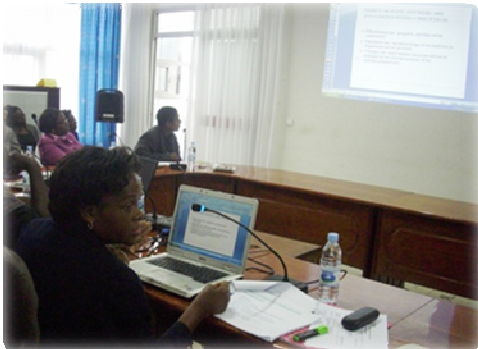
P.03 and P.04. The University of Buea Anti-Corruption and Ethics Committee Members in attendance during training