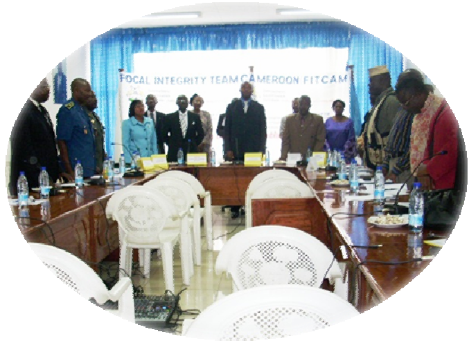
P.01. Public banner hosted for the project. P.02. Public launching meeting of the UB